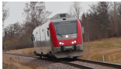
Y31 at Slattefors, April 2022

The engine house in Kisa was built 1901-1902 by ÖCJ as a roundhouse with one door and stable place. It stored mainly over-night-standing steam locomotives. The ÖCJ workshop was situated in Linköping. Today the line's workshop, called "Tågdepå", is to be found in Kalmar.