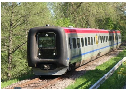
Y2 at Kisa, May 2024

The passenger trains are operated by DMUs (diesel multiple unit) Class Y2 , built in 1996 and 1997, no. 1379-1384, and Class Y31 , built in 2010. In a couple of years (2027) they will be replaced by new BMU (bimodal multiple unit), Class BIR1 , which can be powered either by electric power from the overhead lines or a choice of onboard HVO-diesel engines or batteries.